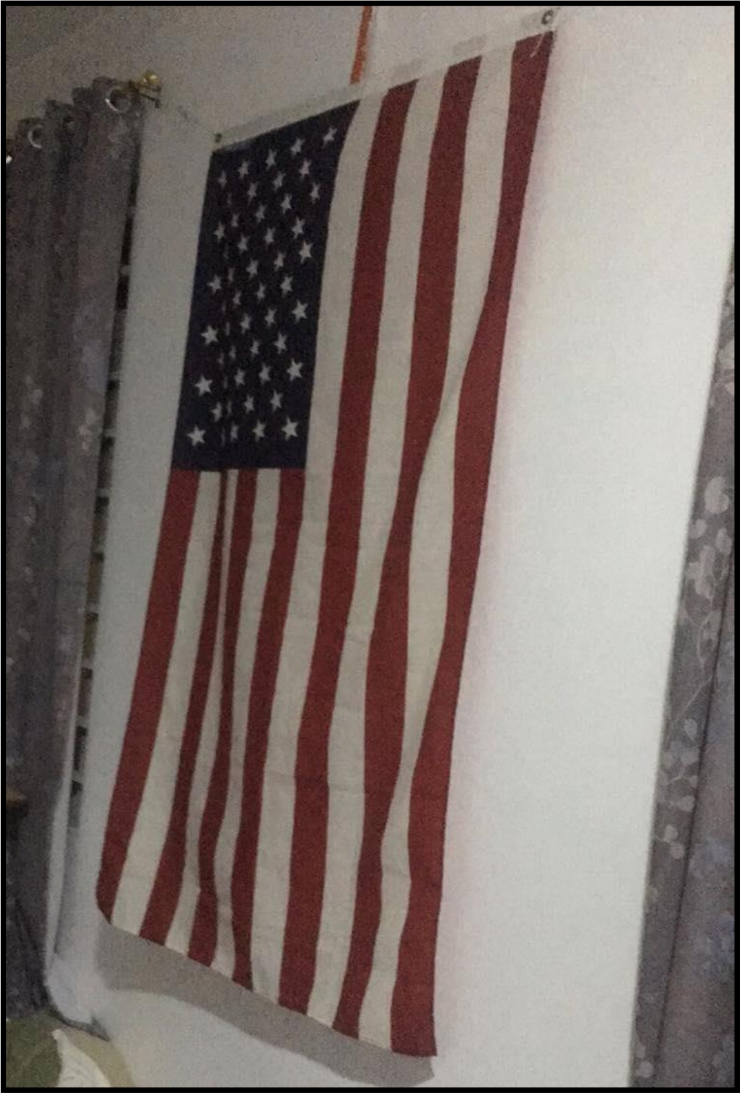
FLAG DISPLAYED ON MY WALL, (Photo Taken 1/19/2023):